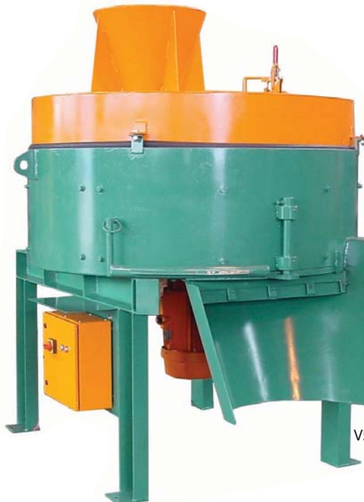
V500 with optional dust cover and inlet chute